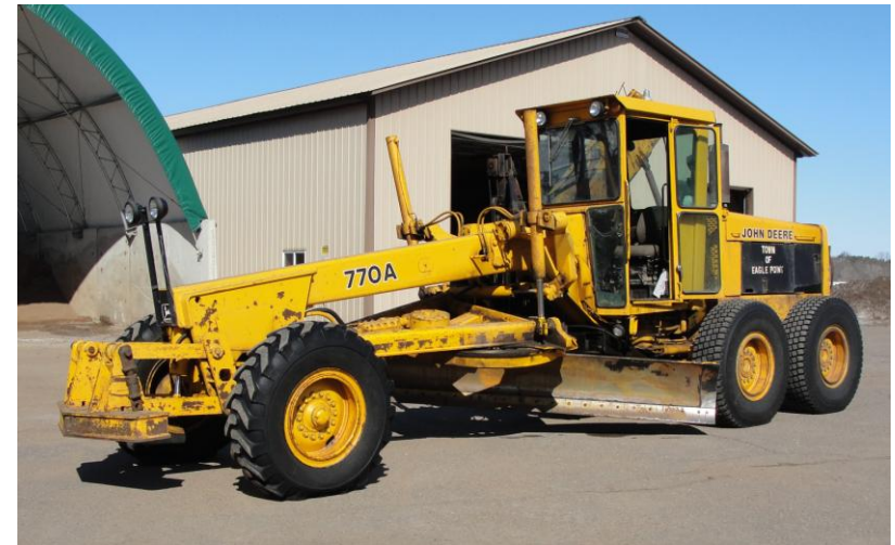
1982 John Deere Grader