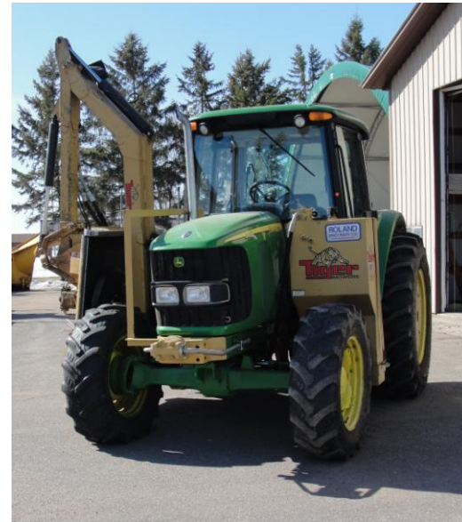
2006 John Deere Mowing Tractor