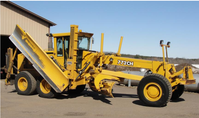
2001 John Deere Grader