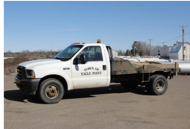
2004 One Ton Truck