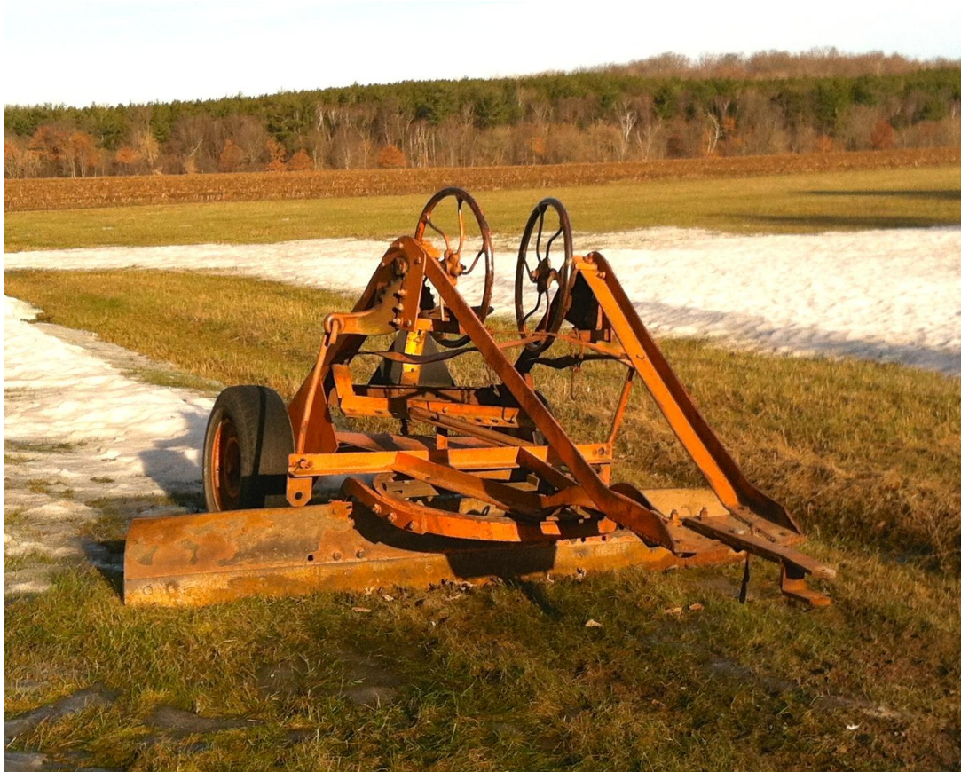
And Possibly Our First Road Grader