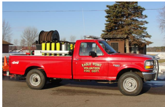
1996 Brushfire Truck