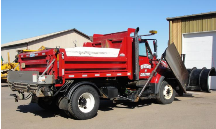
2007 Plow Truck