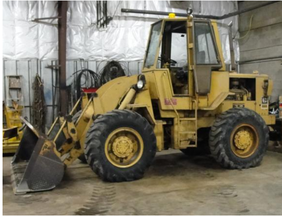
1978 End Loader