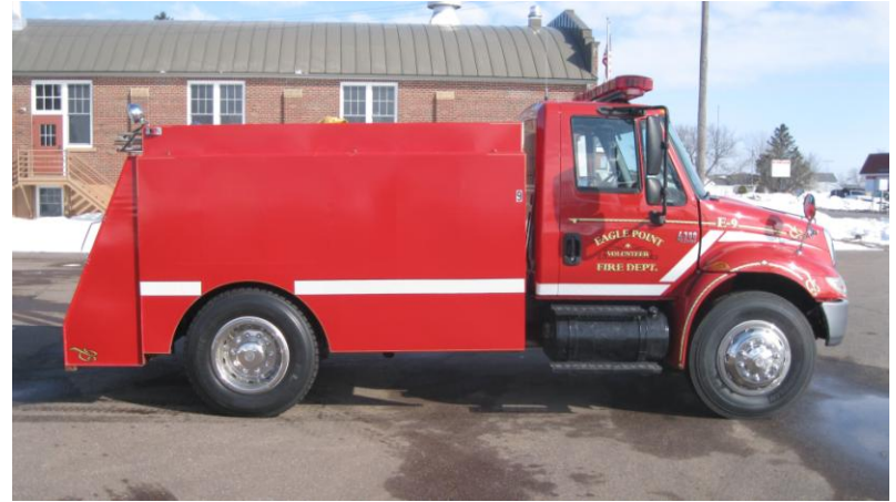
2004 Tender #2