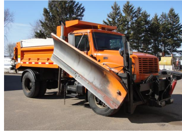
2001 Plow Truck