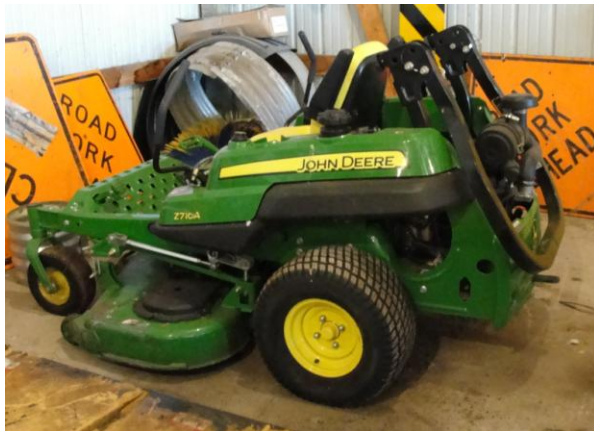
2011 John Deere Lawn Mower