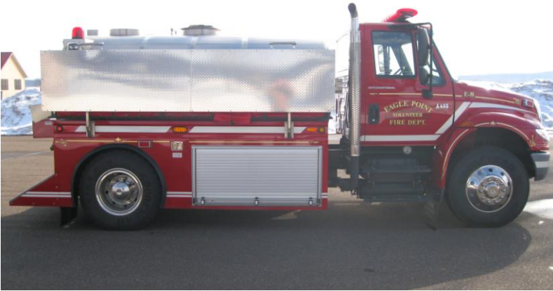
2006 Tender #1 with pump