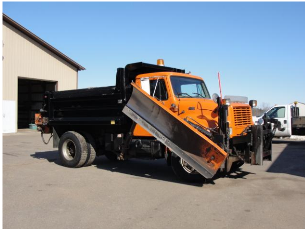
1996 Plow Truck